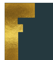
No. 9 First Floor Apartment 3

The dimensions provided on these plans are subject to variations and are not intended to be used for carpet sizes, appliance sizes, or items of furniture.